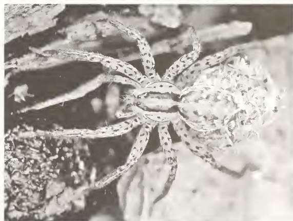
Fig. 1: Pulli-carrying behaviour of Hygrolycosa rubrofasciata . Newly emerged spiderlings occupy the surface of the cocoon instead of climbing onto the opisthosoma of their mother.

All females (of both H. rubrofasciata and P. amen-tata ) accepted, sooner or later, cocoons of the other species. After emergence, spiderlings of H. rubrofasciata did not try to climb on the opisthosomas of P. amen-tata females and remained on the cocoon surface (Fig. 2). By contrast, spiderlings of P. amen-tata tried to climb